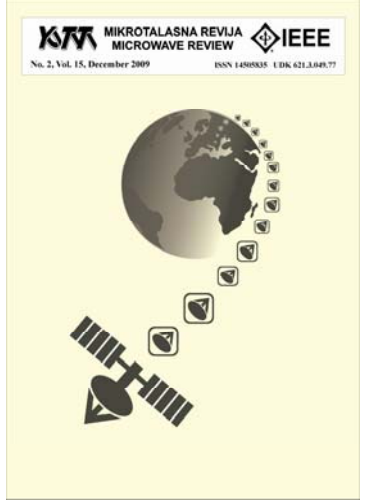
Microwave review Vol. 15, No 2

Two issues of the Microwave Review journal, a publication of MTT-S Chapter of Serbia and Montenegro and national Society for Microwave Technique and Technologies have been published in this period. One was published in December 2009 (Vol.15, No.2) and the other in July 2010 (Vol.16, No.1). Microwave Review is available in electronic version on the web site: <a href="www.mwr.medianis.net">www.mwr.medianis.net</a>. It should be noted that the journal has been included into INSPEC database since November 2008.