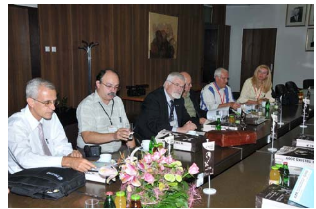
Detail from the meeting with the invited authors

This conference continued the success of the series of previous TELSIKS Conferences, providing a good atmosphere for academic discussions, exchange of experiences and networking of the conference participants.