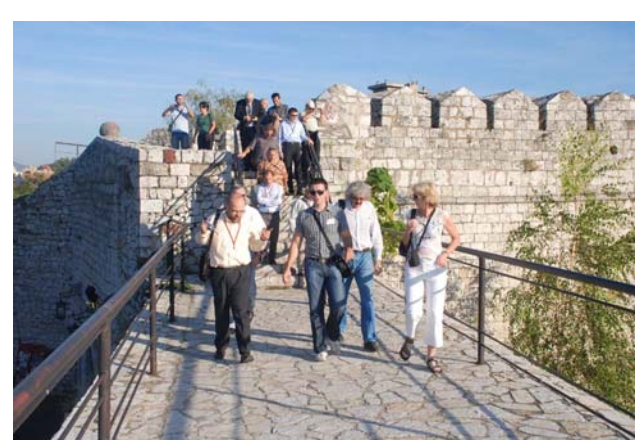
Sightseeing – The fortress of Niš