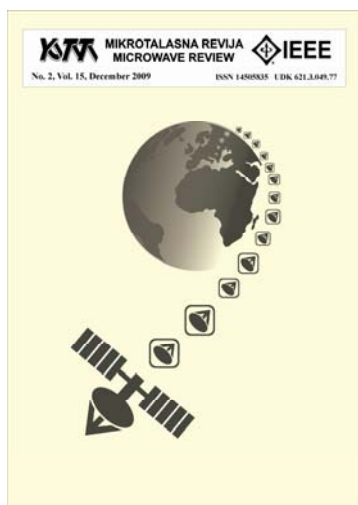
Microwave review Vol. 15, No 2

Two issues of the Microwave Review journal, a publication of MTT-S Chapter of Serbia and Montenegro and national Society for Microwave Technique and Technologies have been published in this period. One was published in December 2009 (Vol.15, No.2) and the other in July 2010 (Vol.16, No.1). Microwave Review is available in electronic version on the web site: www.mwr.medianis.net . It should be noted that the journal has been included into INSPEC database since November 2008.