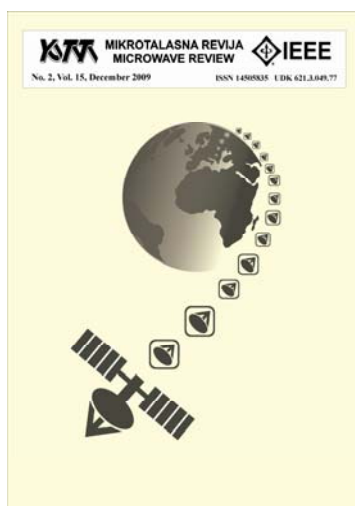
Microwave review Vol. 15, No 2

Two issues of the Microwave Review journal, a publication of MTT-S Chapter of Serbia and Montenegro and national Society for Microwave Technique and Technologies have been published in this period. One was published in December 2009 (Vol.15, No.2) and the other in July 2010 (Vol.16, No.1). Microwave Review is available in electronic version on the web site: www.mwr.medianis.net . It should be noted that the journal has been included into INSPEC database since November 2008.