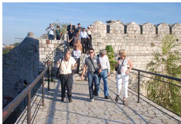
Sightseeing – The fortress of Niš