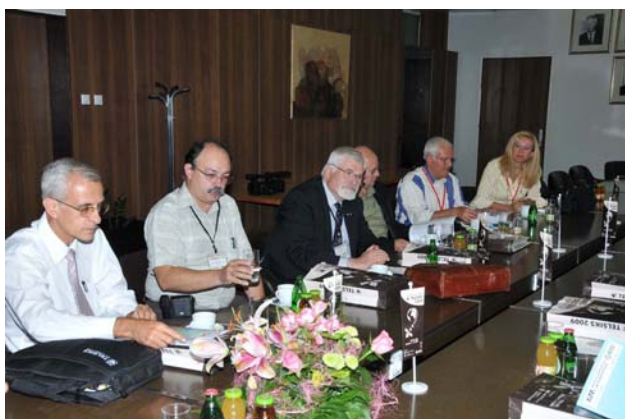
Detail from the meeting with the invited authors

This conference continued the success of the series of previous TELSIS Conferences, providing a good atmosphere for academic discussions, exchange of experiences and networking of the conference participants.